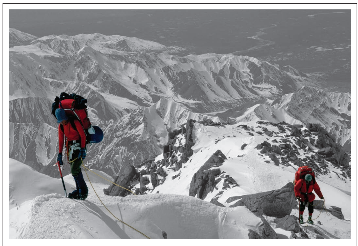
The Explorer Discovering Spiritual Journeys

Think of explorers throughout history. They entered unknown territory to discover, learn, and understand. (For historical accuracy we might also mention "plunder," but that's not the connection we're looking for here.) Whatever their motivation, they embarked on journeys of discovery. In a similar way, we become spiritual explorers on journeys of discovery in the lives of others. Love compels us to engage conversationally, seeking to discover, learn and understand who they are and where they are going spiritually.